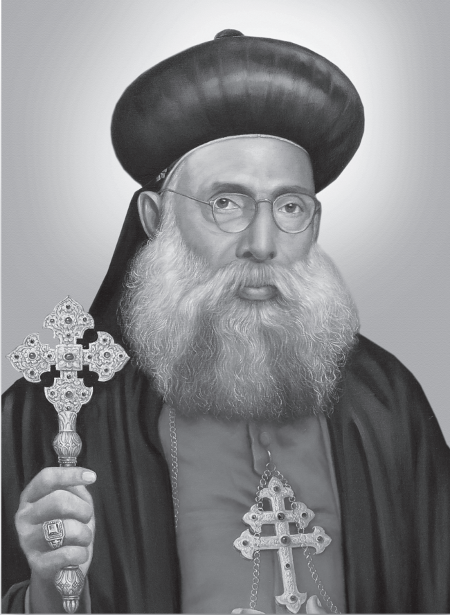
Servant of God Mar Ivanios